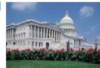
Exhibit to showcase benefits, uses and the science of turf improvement is progressing

In the spring issue of this newsletter, we introduced the concept of an outdoor turfgrass exhibit to be established at the U. S. National Arboretum , a 446 acre USDA, ARS research and education public gardens facility three miles from the U.S. Capitol in Washington, DC. The National Arboretum is the home of many beautiful gardens and collections, as well as the Capitol Columns, the original sandstone columns from the East side of the U. S. Capitol. With over 500,000 visitors each year including members of Congress, the National Arboretum excels in research and education programs for young and old alike.