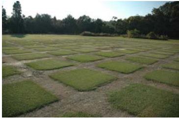
The 2007 NTEP Bermuda trial at Baton Rouge, LA