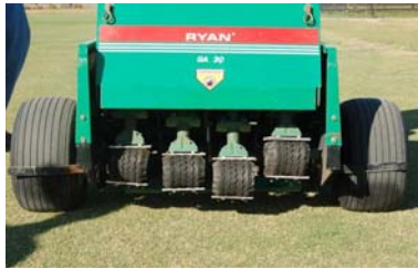
The Cady, originally built by Michigan State researchers using a Ryan GA-30 aerator and fitted with cleats, is used for traffic simulation on the Gainesville, FL NTEP bermuda

After establishment in 2007, the current NTEP warm-season grasses trials are providing important data. Following is a wrap-up of the information available for each trial: